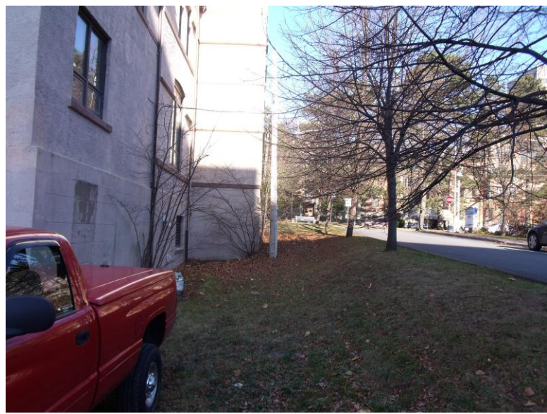
Land sloping toward building. A cistern/planter box will be installed here.