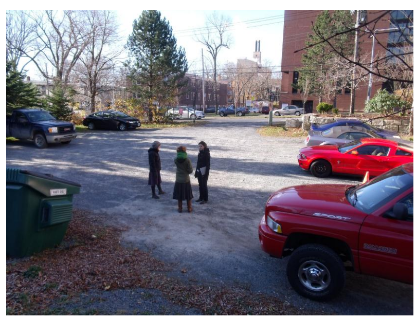
The large gravel parking lot will be redesigned