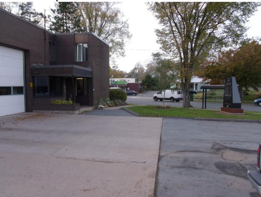
Large impervious area (with monument)